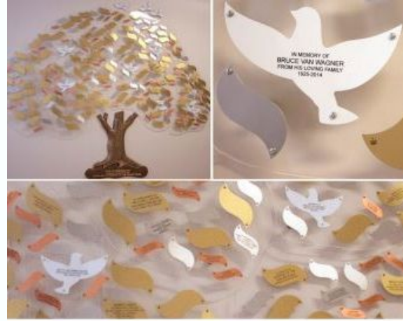
The Tree of Remembrance